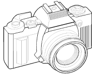
PHOTO DOCUMENTARY SERVICES

BEAUTIFUL COPIES OF YOUR TREASURED ORIGINALS FOR A PRICE YOU CAN ENJOY TOO.